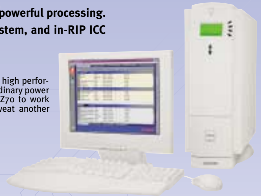
*ColorPASS-Z70 shown with optional Advanced Controller Interface Kit.

So, if you're in need of high performance, put the extraordinary power of Canon's ColorPASS-Z70 to work for you. And never sweat another deadline.